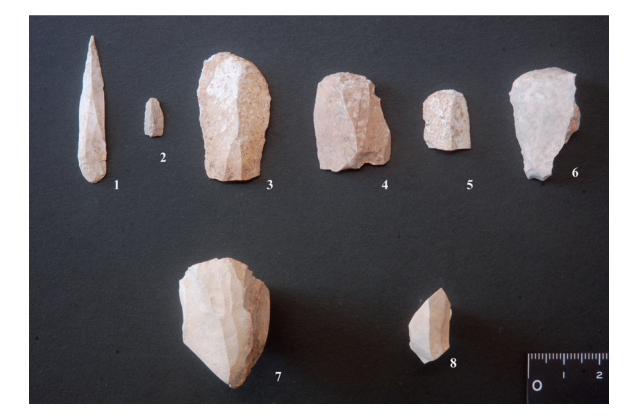
Figure 7: Upper Palaeolithic artifacts from 16R1. 1: el-Wad point, 2: Bladelet with Ouchtata retouch, 3–5: End scrapers, 6: Laterally carinated scraper, 7–8: Bladelet cores.