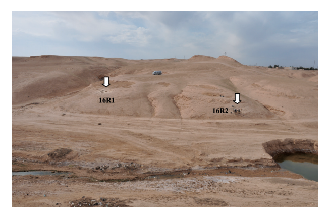
Figure 6: Locations of test trenches at Area 16R on the west bank of Wadi Kharar, looking west.