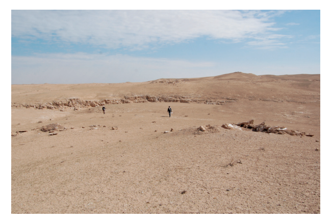
Figure 2: Burial cairns at the western side of Wadi Beilune seen in the middle, looking east.

were also collected. Tentative observations of the lithic assemblages date them to Upper Palaeolithic (Fig. 7), but further analyses are necessary to specify technological characteristics.