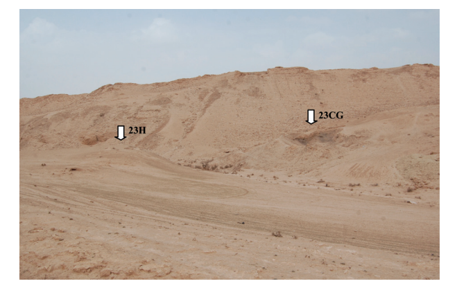
Figure 4: Tell Jezla (23H) and another mound site (23CG) separated by Wadi Jezla. Behind them is the Jezla fortress, looking north.