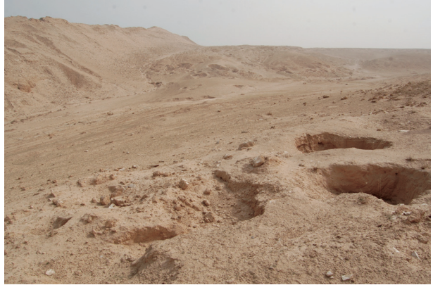
Figure 3: Looted MB tombs in front and Tell Jezla (23H) seen in the middle. Top left is the Jezla fortress, looking southeast.