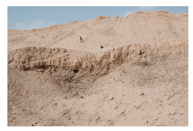
Figure 5: Thick ash deposit exposed at the 23CG mound in Jezla, looking north. Farther side is the Jazla fortress.